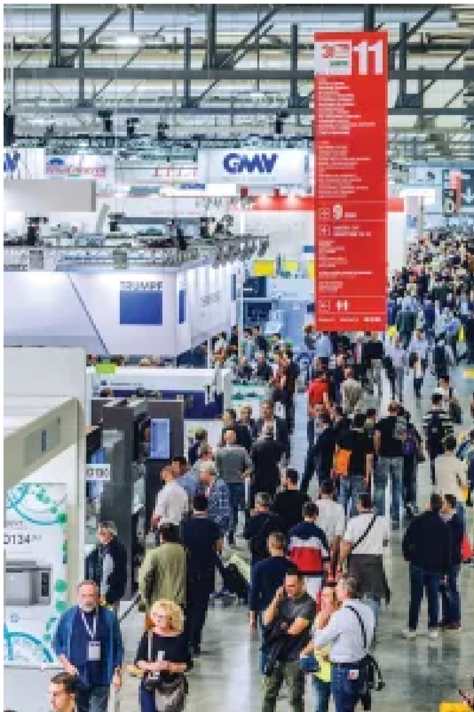
Technology renewal the theme of Italian machine tool show