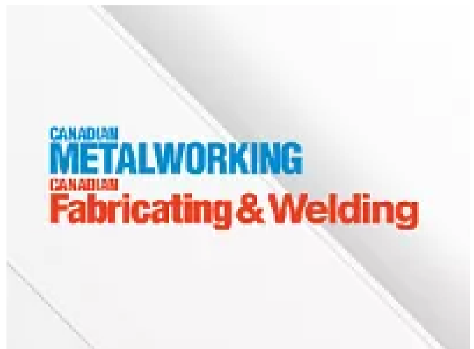
MMTS - Montreal Manufacturing Technology Show